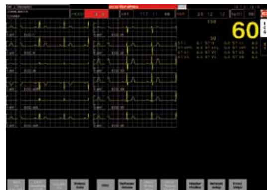
Unique "All ECG Leads" display which is activated by a single command.