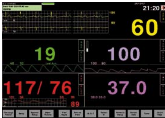
Large Numbers Display in the highest resolution available by a 12" Monitor. Example data contains ventilator information.

The VitaLogik 4000 Series Patient monitoring system is a compact monitor suitable for a wide range of patient applications. The product is available in two versions: a non invasive monitor - VitaLogik 4000 and an invasive monitor - VitaLogik 4500. The VitaLogik 4000 series offer solutions to both intermediate and critical care monitoring. These systems are easily adapted to a diverse range of monitoring requirements including: Adult, Pediatric, Neonatal and Patient Transport. Each device can be customised to meet the user's needs. As computerised monitors, the Vitalogik 4000 series, allow users to take advantage of data connectivity, embedded data storage capabilities and high resolution display.