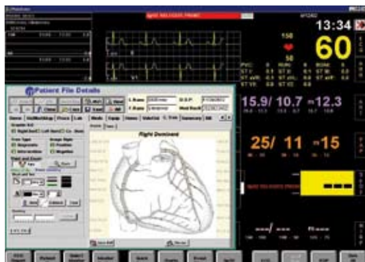
Standard communication protocols and long term patient data archiving capabilities. Access information from a variety of systems on the hospital network – laboratory, radiology PACS, host based hospital systems and others, including a unique, automatic alert for laboratory results.